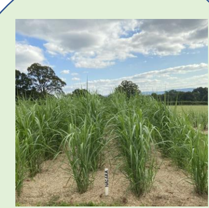
30,000 ha/ year of new High Biomass crops for the next 10 years